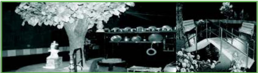
"The Light of Life in Darkness"