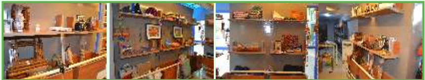
Vision In The Dark