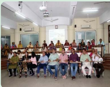
BPA has a common birthday celebration every month for staff whose birthdays fall in that month. The birthday celebration were held on 23 September, 2022 | 22 October, 2022 | 21 November, 2022 | 31 December, 2022