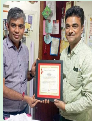
Certificate of Appreciation by Prathama Blood Bank: A Certificate of Appreciation was awarded to the Blind People's Association by Prathama Blood Bank for organizing a blood camp on the campus on December 3rd, World Disability Day.