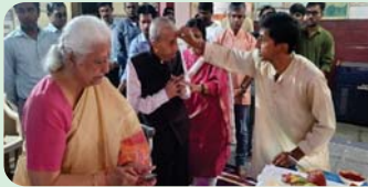
5 October, 2022: Dusshera Pooja was held in the workshops of the BPA and the machines were worshipped as per the Indian tradition.