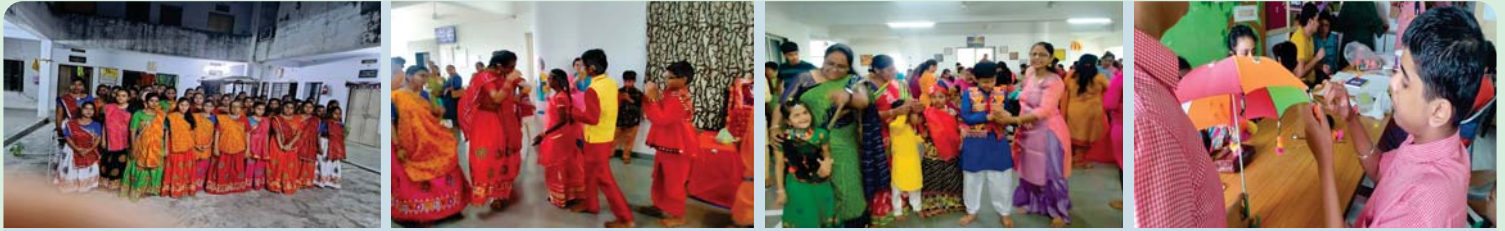
7 October, 2022: Lions Club of Vastrapur, Blind People's Association and BPA Staff Welfare Fund organized the Garba Mahotsav at BPA campus.