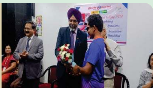
6 June, 2022: Celebration of completion of 10 years of launching of Accessible ATM by Union Bank of India at Blind People's Association