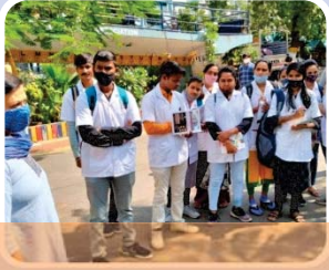
Students of Kanoria Centre of Psychology