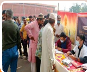
Checkup Camp for Auto drivers supported by Sight