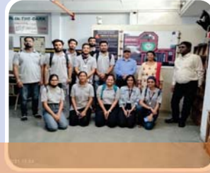
Students of L.J. College, Ahmedabad