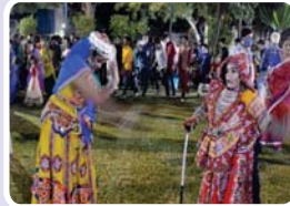
NAVRATRI October: Dushera Pooja Garba