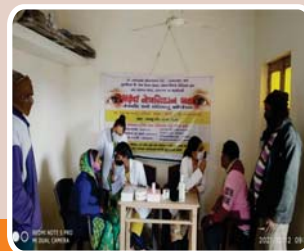
Itadi camp by SVCT