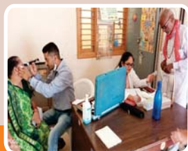
At KCRC, Bhuj