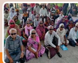
Patients after surgery