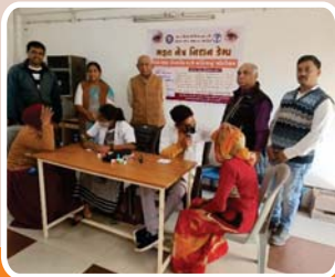
Hapa, Himmathnagar, Sabarkantha