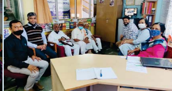
Meeting with local donors