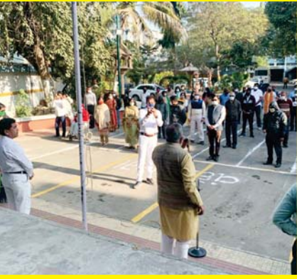
BPA Main Campus, Vastrapur