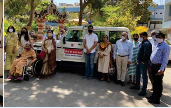
Delivery and Inauguration of the Mobile Van to BPA Bareja Hospital on 3 March, 2021.