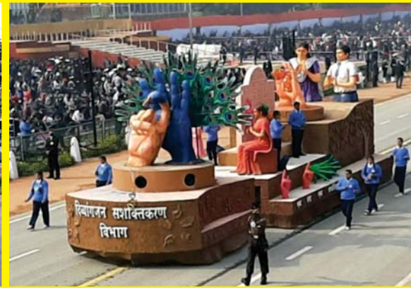
First time the Department Jhanki on Sign Language is included in Republic Day