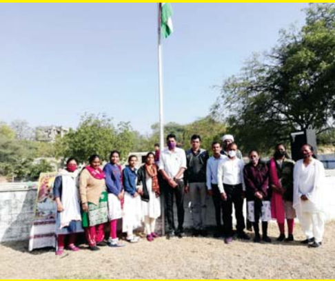
MSM-Naaz Centre, Naaz