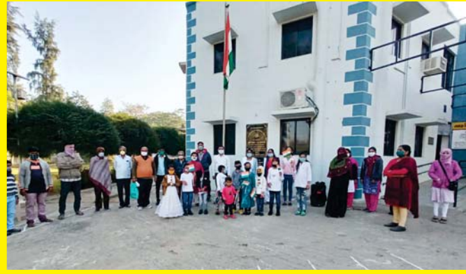
BPA-KCRC, Bhuj Centre