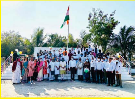
BPA-Porecha Hospital, Bareja