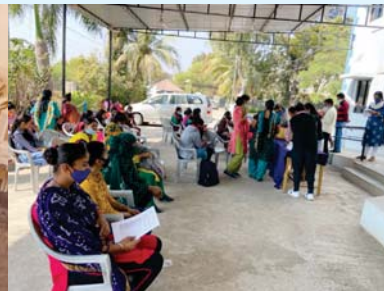
Registration for Eye Surgery