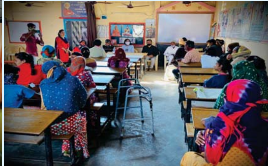
CBR Training at Ramdevnagar, Bhuj