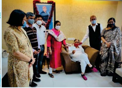
Handed over a Cheque of Rs. 8 Lakhs for Mobile Van for BPA Bareja Hospital on 2 February, 2021.