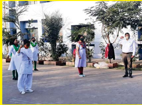
Sammilit Pathshala, Bavla