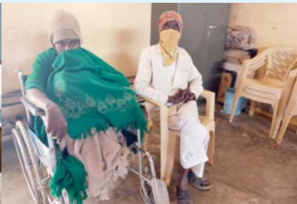
Assistive Devices to Beneficiaries