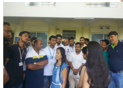
40 staff from Tata Communication