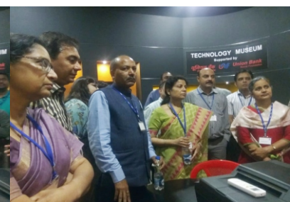
Visitors from Indian Institute of Management, Ahmedabad