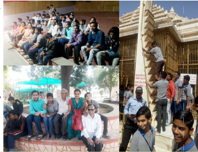
Students and staff of ATCB - Secondary and Higher Secondary School to Mahudi and Indroda Park, Gandhinagar on 25-27 February, 2019