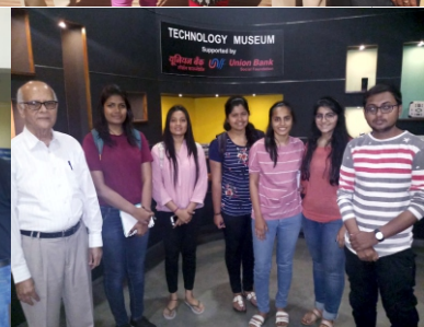
Students of School of Design GLS, Ahmedabad