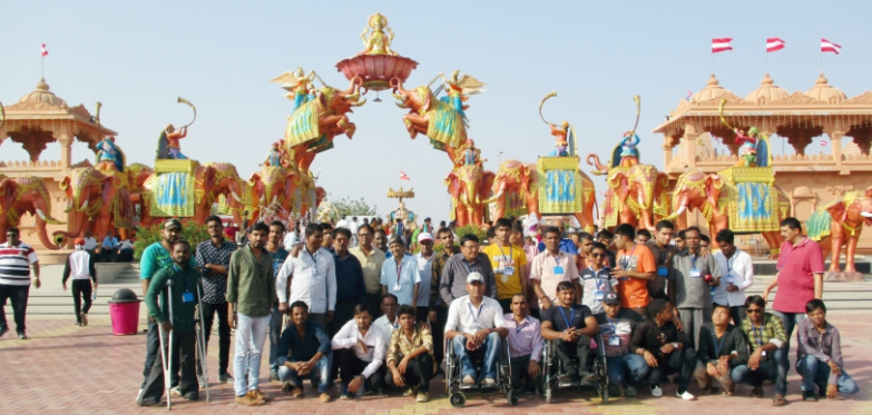
Students and staff of BPA visited Vaishno Devi