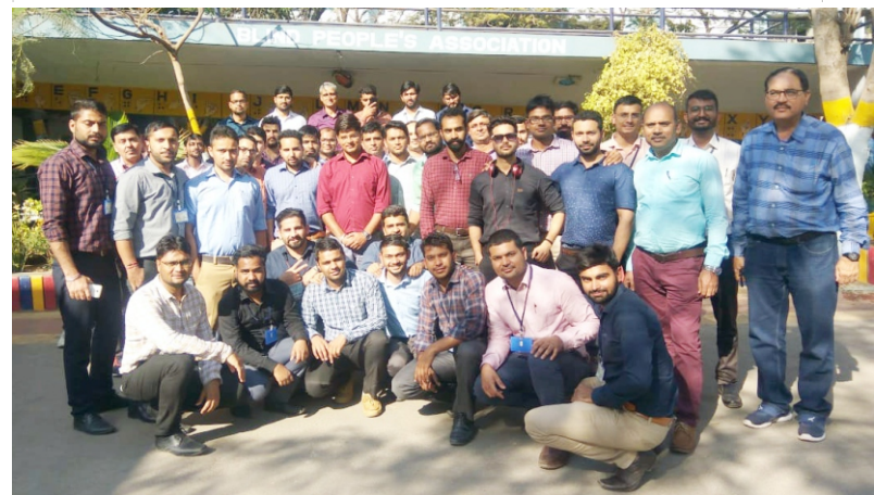
Staff from Income Tax Office