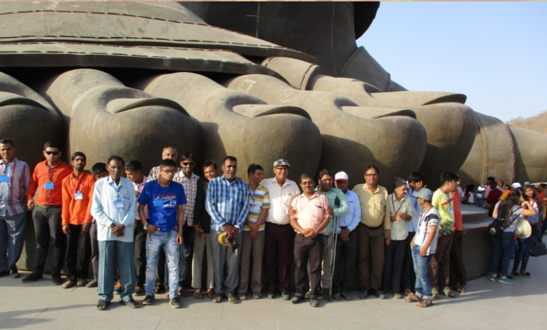
Students and staff of NATCB Workshop to Nilkanth Dham - Poicha & Statue of Unity on 23-24 March, 2019